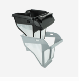
Filter canister Dual stage filter: 150/60 µ